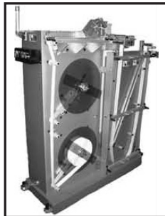
KR565 Splicing Unit

KR 565 LABEL SPLICING UNIT: Designed to provide nonstop, uninterrupted labeling when used with