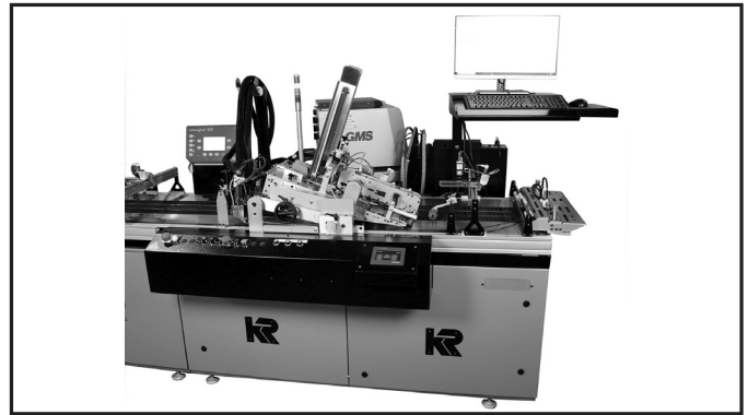
Kirk-Rudy KR497T Servo Attaching System