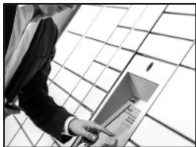
Step 2 - Recipient enters one-time PIN code.