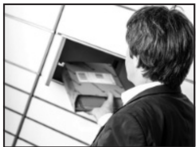
Step 3 - Package retrieved.

HOW IT WORKS: Having Parcel Pending by Quadient intelligent lockers alleviates crowded mailrooms and eliminates multiple delivery attempts. Consumers can pick up packages on their time — anytime. A delivery notification is sent via text or email when the parcel arrives. The recipient enters their one-time PIN code, the door opens for recipient to grab their parcel and go.