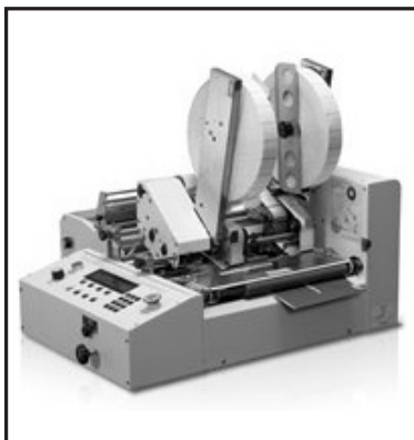
Pitney Bowes W360 Tabber System

W360 MULTIFUNCTION TABBER SYSTEM: The W360 Multifunction Tabber System has some of the most advanced features for a tabletop model and it has the capability to meet all the latest USPS regulations