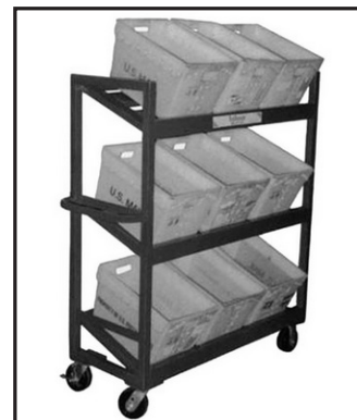
The TrayTruker (left) and TubTruker from Mail Automation, Inc.

trays. Accessible from either side. Durable steel construction. It measures 46" long x 71" high x 25" wide. Use different colors to differentiate mail.