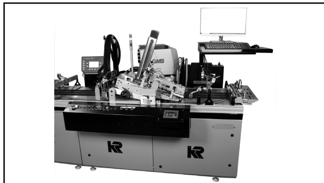
Kirk-Rudy KR497T Servo Attaching System