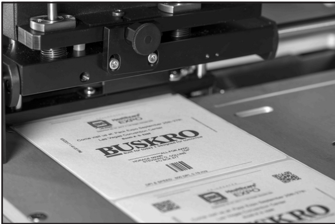
Buskro Digital Label Press