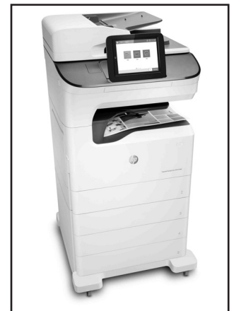
HP PageWide E Series

HP PAGEWIDE E SERIES: The HP PageWide E Series was built to