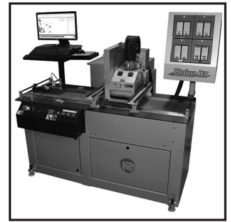
KRC500 Kolor Jet Printer

CONTACT: For more information, call 770-427-4203 or email info@kirkrudy.com .