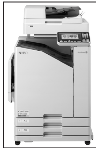
Riso ComColor® Series Printers

COMPANY: Pitney Bowes Inc., 3001 Summer Street, Stamford, CT 06926-0700. Tele: 877-682-7687. Web: PitneyBowes.com