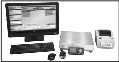
Engineering Innovation's Super Champ

Building on 30 years of direct mailroom experience, The Champ Mailing Solution empowers mailers to maximize postage savings on the variety of parcels common to mail processing centers, including ALL types of USPS Priority Mail. The tabletop mail manifesting system utilizes differential weighing to rapidly handle multiple classes of mixed-weight mail simultaneously.