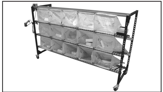
Engineering Innovation's LightSort

LIGHTSORT SYSTEM DESCRIPTION: The LightSort Sorting System uses light technology for expedited processing. Our low-cost systems easily integrates into existing processes to improve accuracy, productivity, and data tracking. LightSort technology is used to create fixtures that are low maintenance, durable, and easy to move for reconfiguration and storage. Quick assembly and intuitive use has operators up to speed in no time, efficiently sorting or filling orders and tracking data using the hands-free ring scanner. With LightSort, Eii proves again that expensive automation is not always the optimal approach. LightSort Technology utilizes low cost equipment to help operators do their job more quickly with reduced human error.