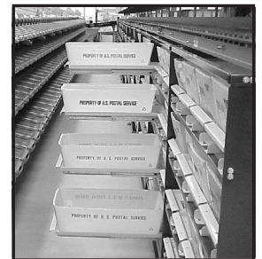
Sorter Tray Racks