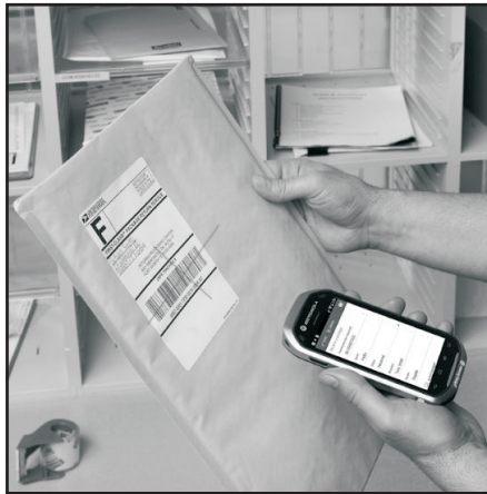
Pitney Bowes SendSuite® Tracking Online

SENDSUITE® TRACKING ONLINE: This is a cloud-based solution that streamlines the logging, tracking and managing of incoming packages and important mail. By simply scanning the barcode, critical shipping and mailing information like carrier, tracking number, sender and recipient will automatically populate within the system, giving you better visibility of your incoming packages and mail. SendSuite Tracking Online defines new standards for precision and accuracy, helping you meet the demands of today's