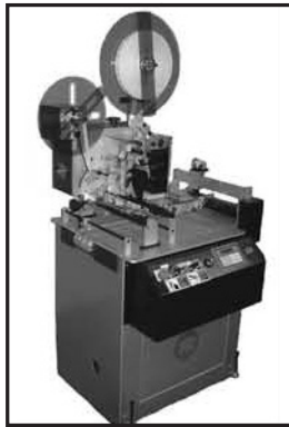
KR435 Mini Tabber

consistent and reliable. Also, the KR 435's operator interface utilizes all the same user-friendly programs found on the KR 535 that simplify operator training and setup. The KR 435 handles large 16" diameter rolls and runs all major types of tabs as well as pressure-sensitive stamps and labels of various shapes and sizes. Multiple tabs or labels can be applied in a single pass. The KR 435 runs in line with most standard addressing systems.