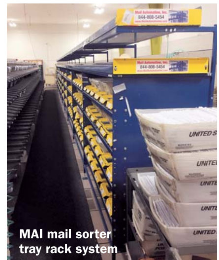
MAI mail sorter tray rack system