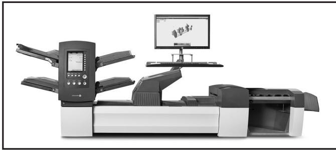
Relay® 5000 Folder Inserter

ments being folded. Add accuracy and further automation with our Relay Integrity Express software, which makes it easy to add barcodes to your documents. The Relay 4500 reads the barcodes to automatically sort and collate variable page-counts to ensure the right documents reach the right recipients.