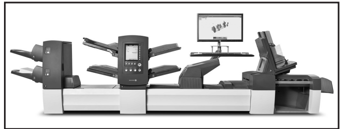
Relay® 8000 Folder Inserter

RELAY® 8000 HIGH VOLUME TABLETOP FOLDER INSERTER: The Relay 8000 is our flagship tabletop folder inserter. Its enhanced chassis gives you monthly throughput of up to 200,000 envelopes per month. This inserting system can process letters and flats in the same mailing run with speeds of up to 5,400 envelopes per hour. You get