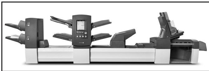
Relay® 7000 Folder Inserter

RELAY® 5000 MID VOLUME FOLDER INSERTER: The Relay 5000 brings our flagship tabletop inserting platform to mid volume mailers to bring you increased speed, flexibility and precision. This inserter folds, inserts and seals up to 62,500 a month with throughput of 4,000 envelopes per hour. We know your customers' privacy and security is critical. The optional file control is a proven Pitney Bowes technology version of file-based processing that goes beyond traditional OMR or 1D and 2D barcodes scanning by using a Reference File to control the folding and inserting process. You can track not only what pages are being folded and inserted, but also which specific pages are intended for each individual customer, giving you the capability to recreate a mailing event at a personalized recipient level. Achieve greater levels of accuracy, security and speed with the Relay 5000 inserting system.