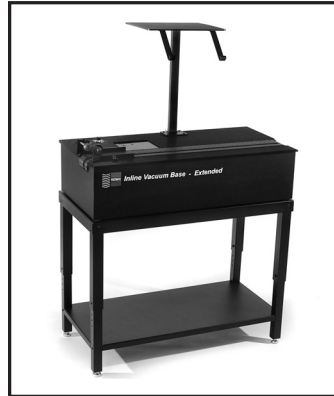
Inline Vacuum Transport Bases