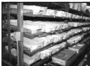
NPI Mail Tray Racks

CONTACT: For more information, call 888-821-SORT or email sales@npisorters.com