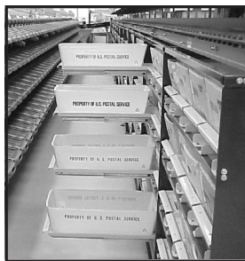
Sorter Tray Racks