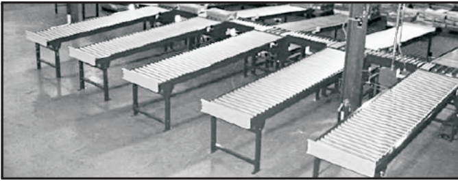
Capitol Conveyors' Gravity Conveyors

Accum. Conveyors; Gravity Roller & Skatewheel Conveyors; V-Belt Live Roller Curves; Floor, Ceiling Supports, Gd. Rl., & Access.