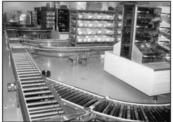
NPI Conveyor Systems

CONTACT: For more information visit www.MailAutomationInc.com or call 844-808-5454 or email Bob@MailAutomationInc.com .