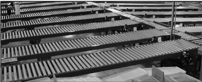
Mail Automation Inc.'s Mail Tray Conveyor Systems

CONTACT: For more information call 844-705-7979 or visit www.capitolconveyorsinc.com