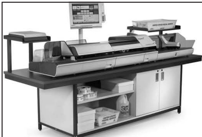
Neopost IS-6000 Mailing System shown with option 70 lb. Weighing platform, dynamic scale, power conveyor stacker, and workstation.

fly capability can stack more than 7" of materials. A dual-pump, jet-spray sealing system with filter ensures a quality tip-to-tip envelope seal. Five levels of spray adjustments are standard with each system. An optional dynamic scale accurately weights, rates and classifies mail at speeds up to 160 LPM. Reliable sensors detect mail dimensions to ensure conformance to USPS Shape-Based Pricing requirements. Each IS-6000 comes standard with a print head that is designed to last the life of the mailing system. Reduce work steps and optimize the ergonomic work space with an optional repositionable remote label dispenser that prints no-peel, ready-to-stick tapes from a roll. An optional custom ergonomic workstation has been designed specifically for the IS-6000 mailing systems. Adjustable shelving is great for holding supplies, while dual locking doors provide additional storage and security.